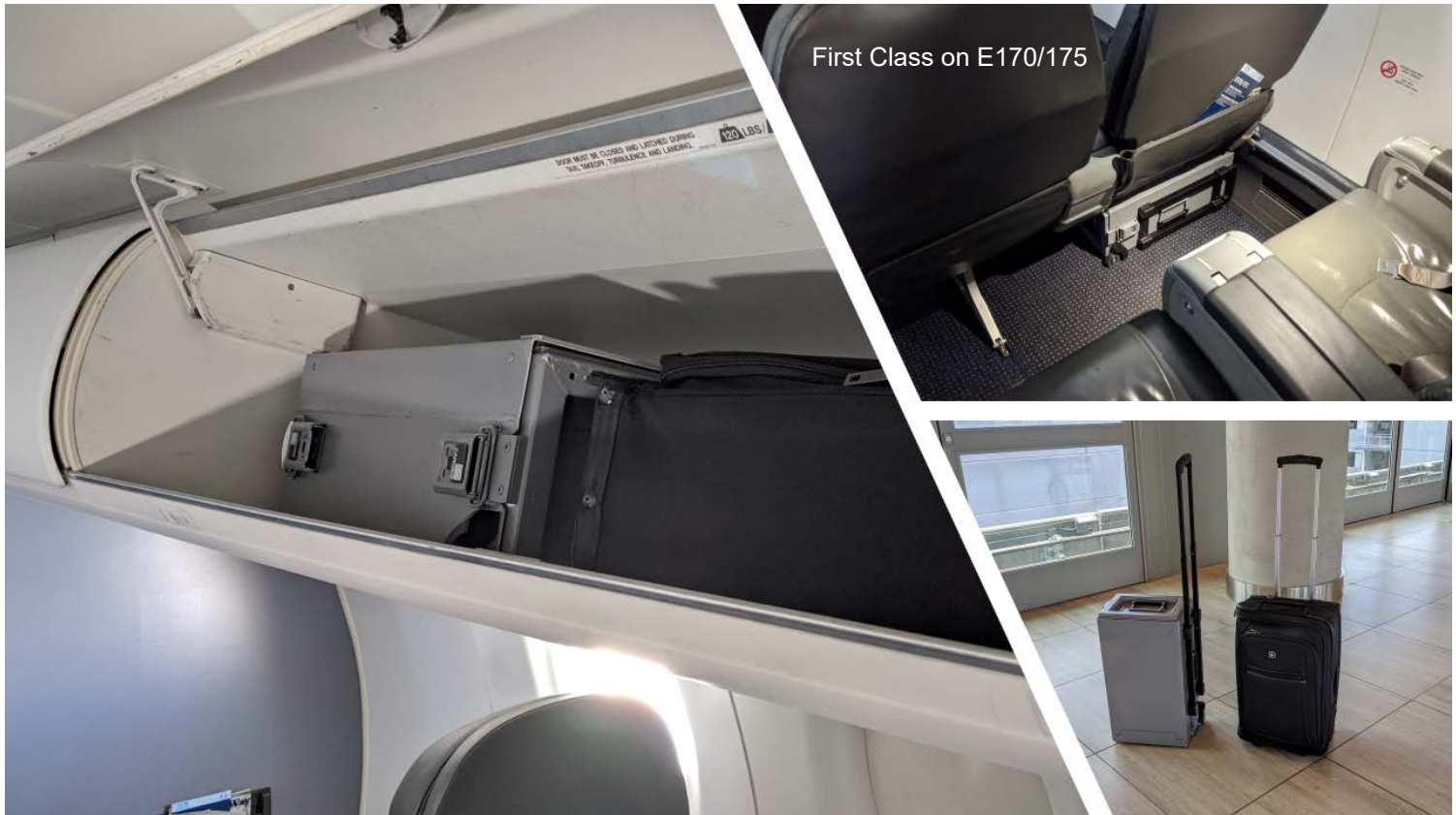
First Class on E170/175